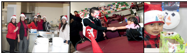
For more: www.flickr.com/AvanceAustin